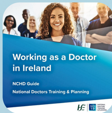
NCHD Guide: Working As A Doctor In Ireland