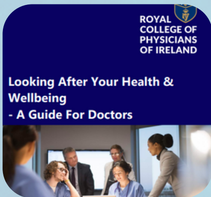
RCPI Looking After Your Wellbeing- A Guide for Doctors