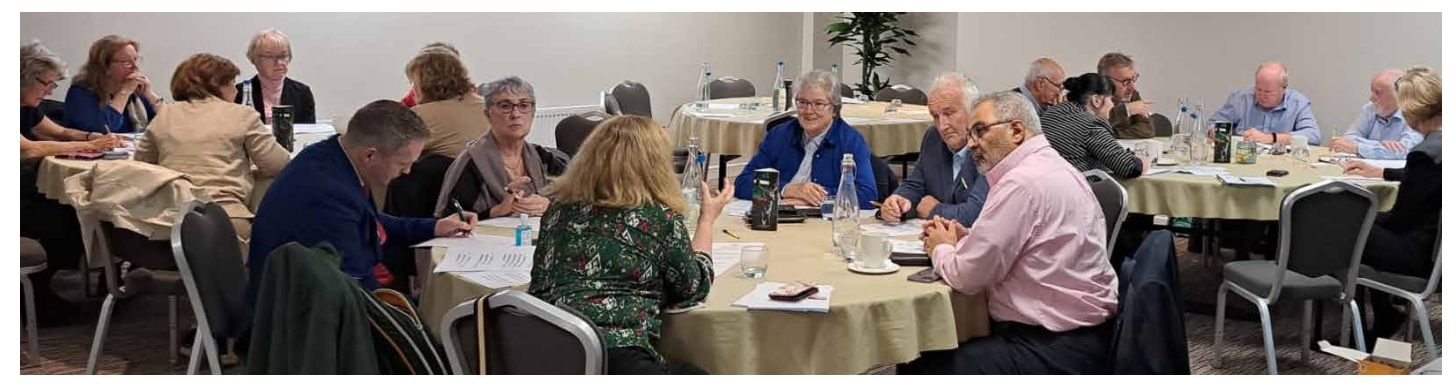
Members of the older person's reference group share what matters to them during a recent engagement.

Service User and Patient Engagement: A National Older Persons Reference Group was established, with representation from 35 Older Persons Councils across Ireland, harnessing the wisdom of our older adult population. The group gathers feedback on the needs and concerns of older adults, which informs proposed health system improvement changes to promote health and support our population to age well. The group met with the National Ambulance Service to share their experiences and suggestions for a more age-attuned service – just one of the many coparticipatory engagements between OPRG and healthcare services during 2024.