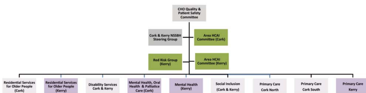
Cork & Kerry CHO Quality & Patient Safety Structures