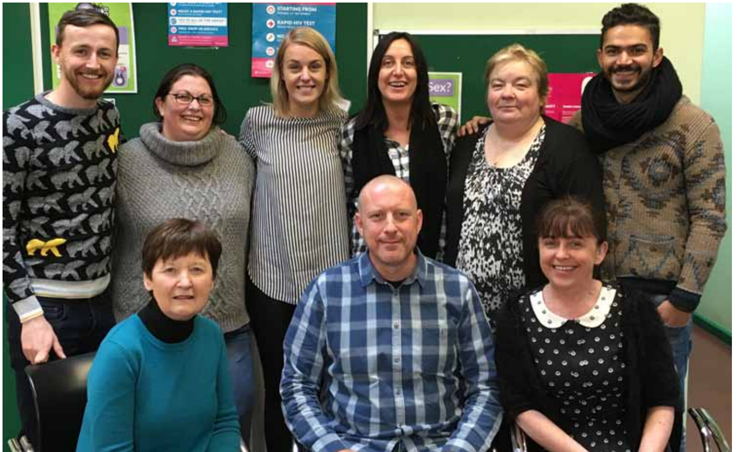
Some of the Monday Clinic team, free friendly and confidential service boost for gay men's health.

Gay Men's Health Service (GMHS) HSE reached its 24th year of operation on October 6th 2016 and continues to be the only statutory Public Health Service in Ireland for Gay, Bisexual Men and Men who have Sex with Men (MSM). The GMHS is funded by HSE CHO 6 and is centrally involved in strategies and actions to reduce the incidence of HIV in the MSM community and beyond.