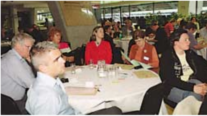
2nd All Ireland Gay Health Forum, Croke Park.