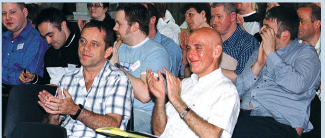
Delegates attending "Viva La Diferencia"

www.gaymenshealthproject.ie the website hosted by the ERHA acts as a reference point for GMHP services, reports and links. The GHN website contains sexual health information at www.gayhealthnetwork.ie