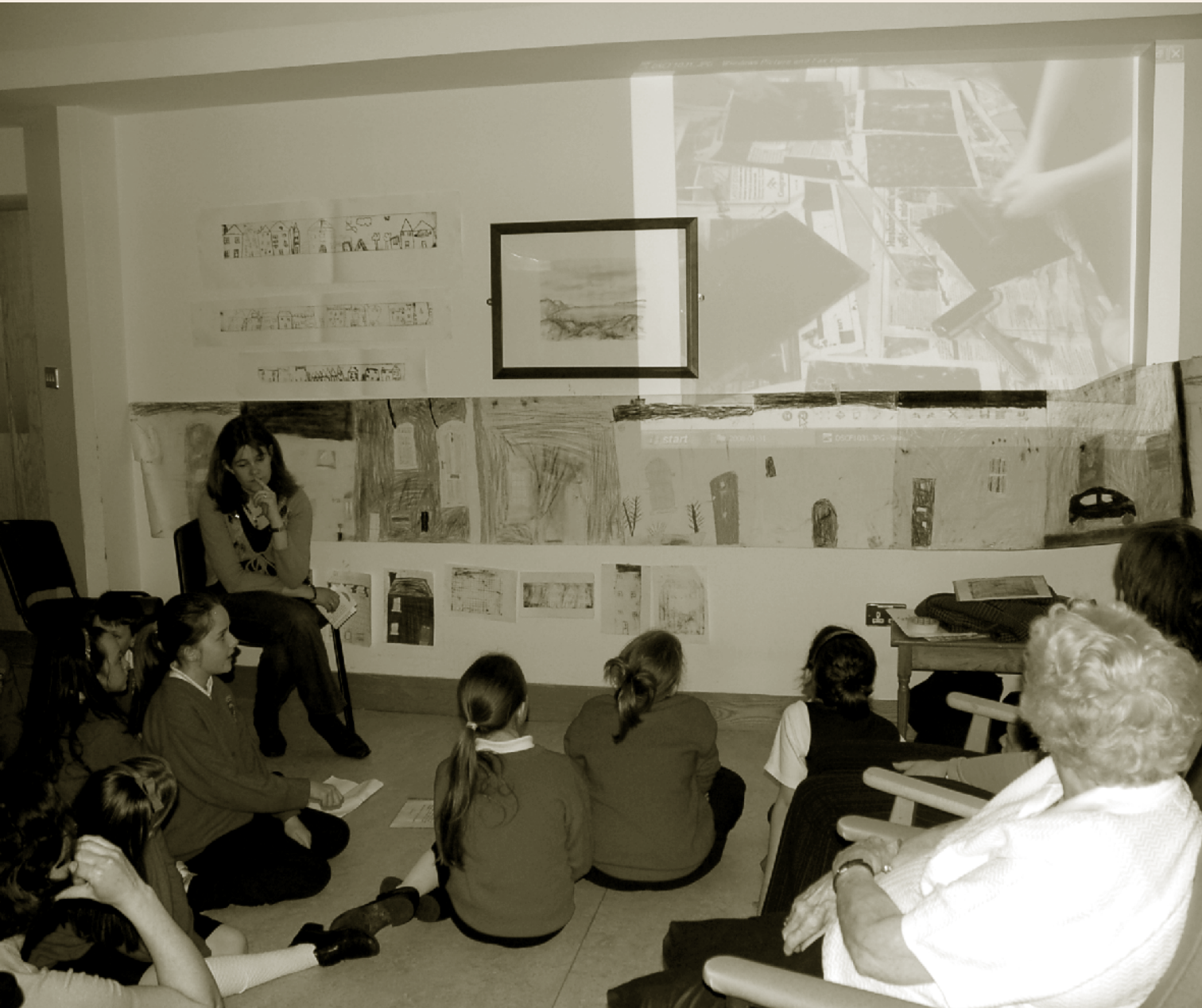
Intergenerational project 2008