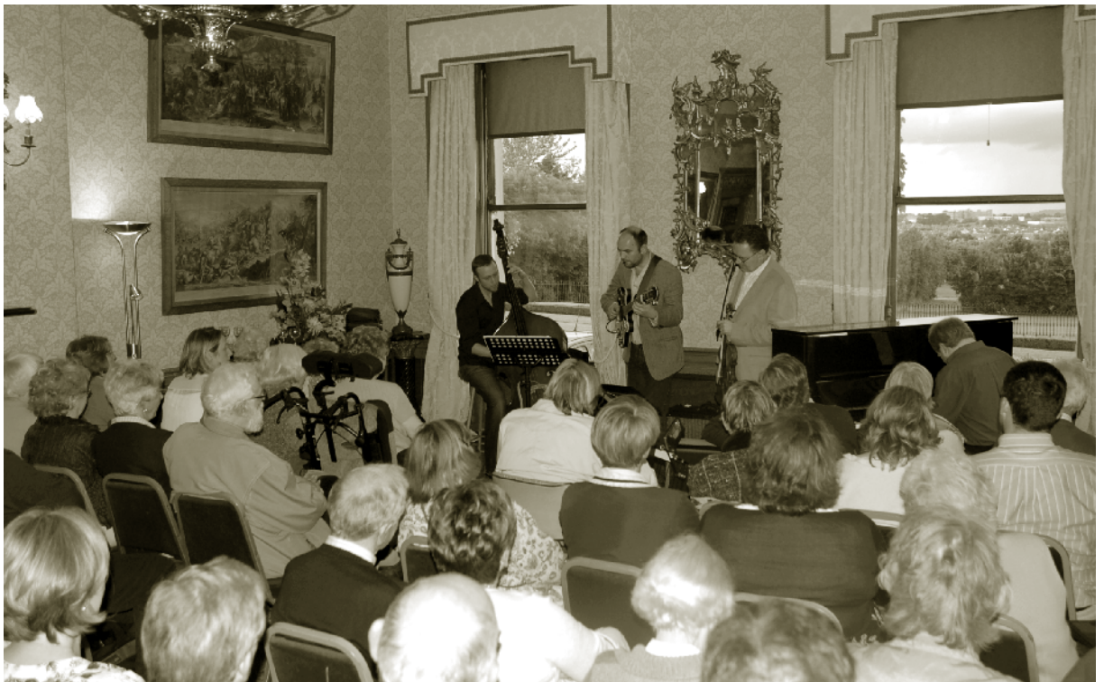
Participants attending Country House Concert in Cabinteely House, 2007