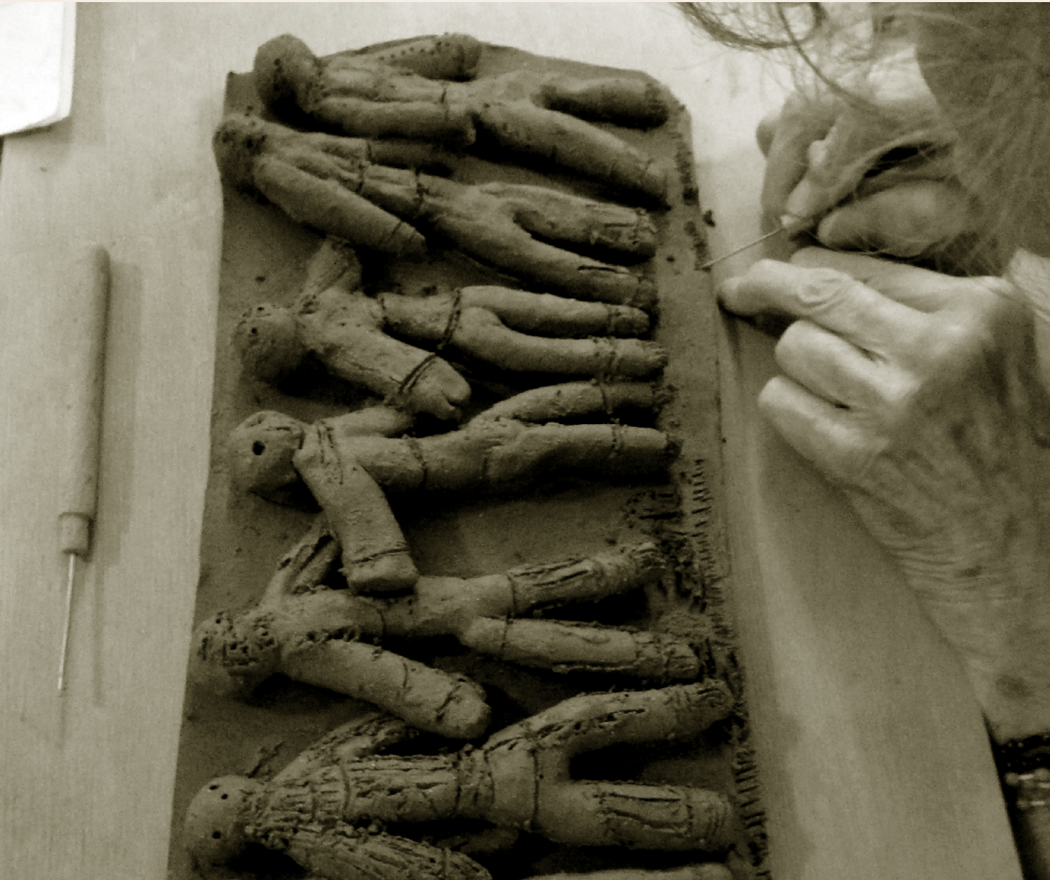
Clay project 2011