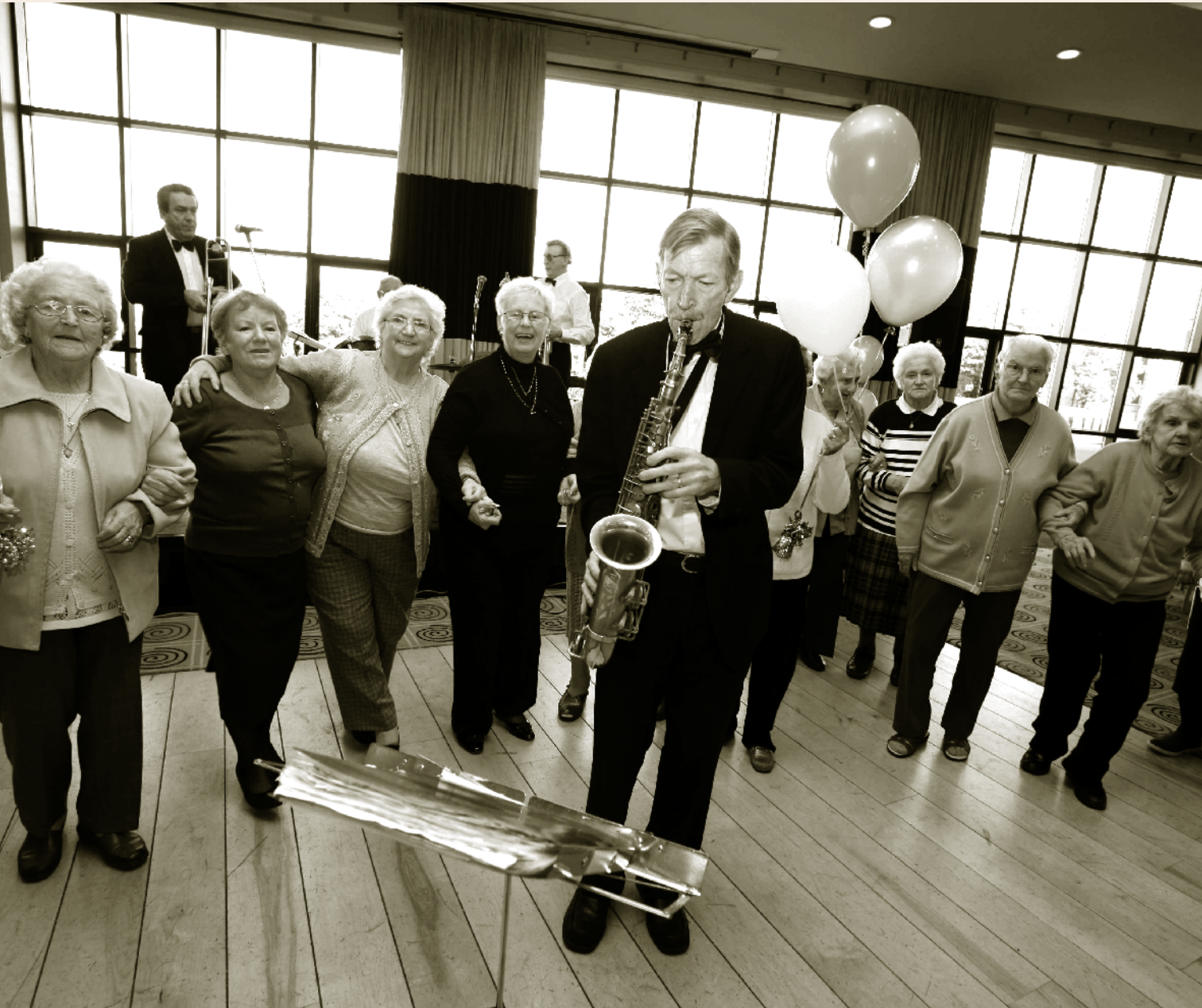
Participants at the Tea Dance in the Royal Marine Hotel 2009