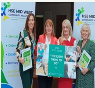
HSE Mid West