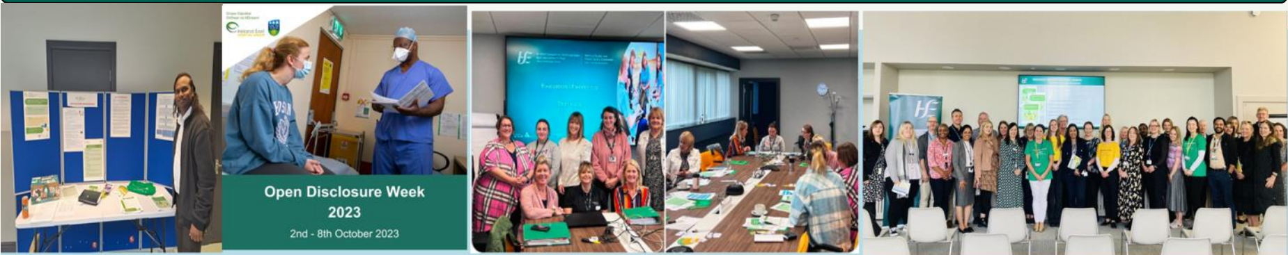
Open Disclosure Week 2023 2nd - 8th October 2023