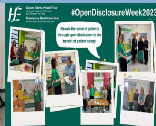
Community Healthcare East