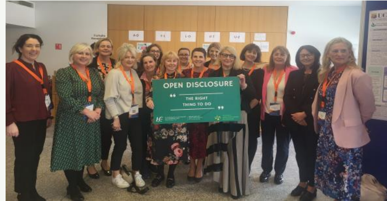
Some of our Open Disclosure Leads at the NPSO conference, 19/10/23

Open Disclosure was the predominant topic at the DoH National Patient Safety Conference held in Dublin Castle on 19 October 2023. The day included a presentation and launch of the Framework and a panel discussion on Open Disclosure developments in the HSE and HSE funded services.