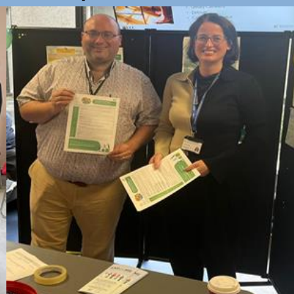
University Hospital Waterford