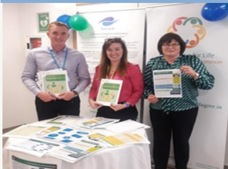
Training and promotions in Community Healthcare West