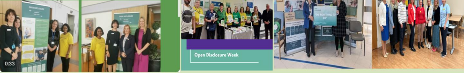
Dublin Midlands Hospital Group

A number of initiatives took place to highlight the importance of Open Disclosure for patients and service-users, their support persons and caregivers - all of whom have a crucial role to play in open disclosure and in improving patient safety.