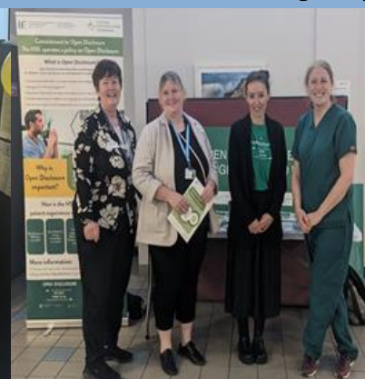
Sligo University Hospital