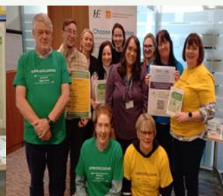
National Screening Service Promotions and Patient Story