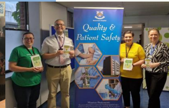
Training and promotions at Beaumont Hospital