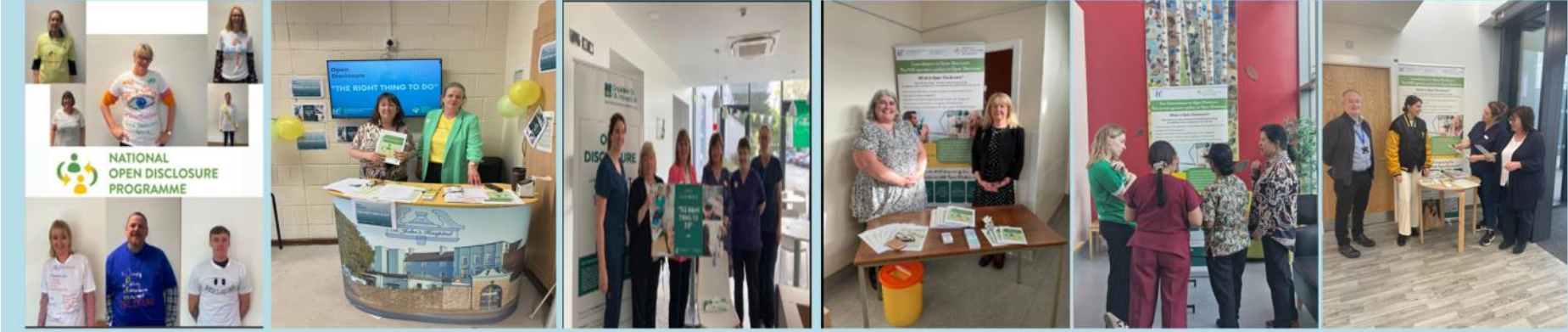
National Screening Service