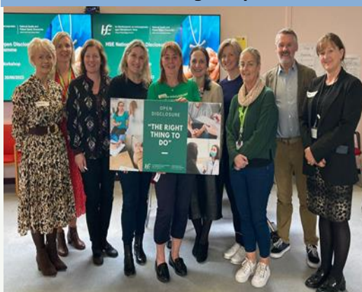
South East Community Healthcare