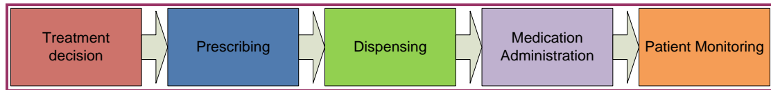
Figure 1: SACT Model of Care

To examine the OAM Model of Care it was necessary to identify the generic SACT model of care and the differences between the models of care for parenteral SACT and OAM. The basic model of care for all SACT treatment is illustrated in Figure 1.